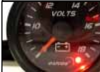
LED warning light